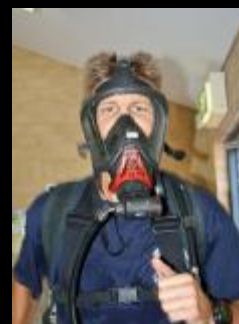
Breathing Apparatus 12kg