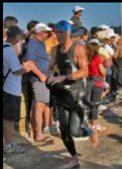
3+ swims covering Up to 10km

6 Weeks Out - 4 runs for 40km including 2 x 12km treadmill runs (Full Breathing Apparatus & over-trousers) 1 interval session 1 road run