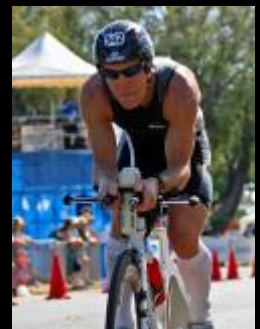
3-5 rides covering 230—350km

2 Weeks Out - Up to 5 runs for 40km including 1 full distance run (Full Breathing Apparatus & over-trousers) 1 interval session 1 road run