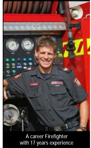
A career Firefighter with 17 years experience